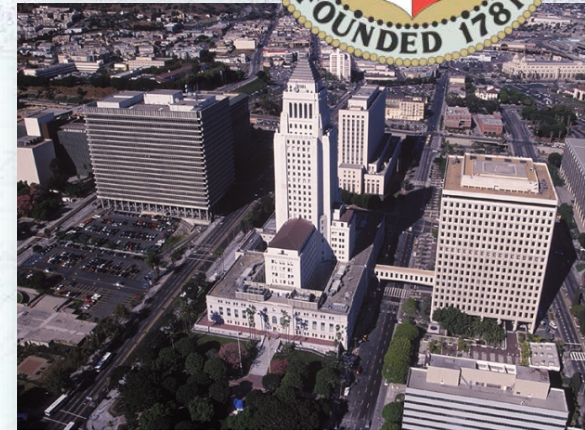
Los Angeles City Hall