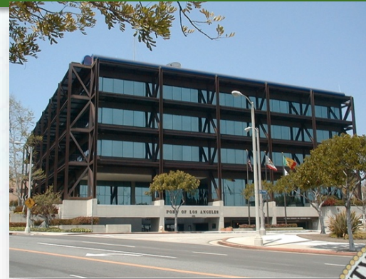
Los Angeles Harbor Department